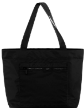
ONYX Black 6C

Textile fabric colours are subject to dye lot variation and will not be exact match to print Pantone reference