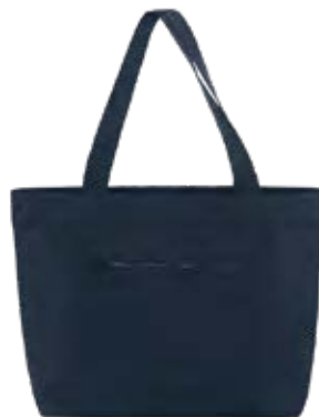
MIDNIGHT BLUE 4280C