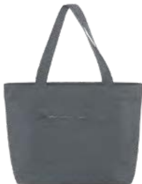
STORM GREY 7540C